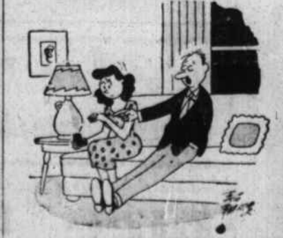
"Those little prongs on top are made to hold a diamond. Now, as soon as I get a raise..."