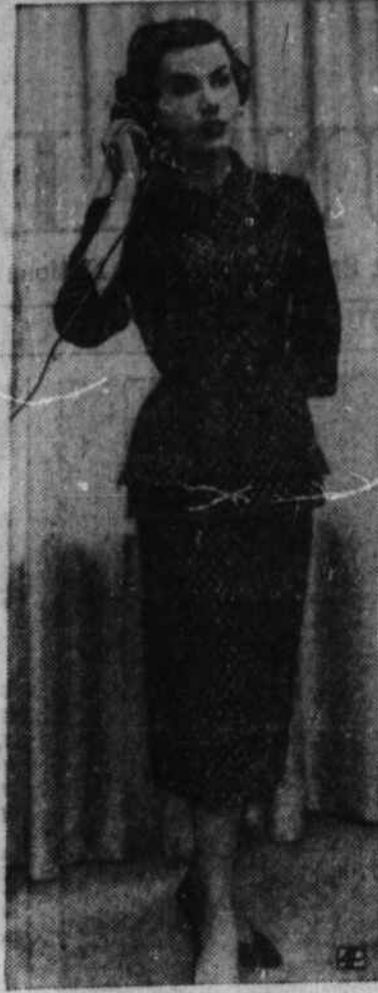
DRESS SUIT . . . One-piece dress that looks like a suit, in black and brown checker knit.