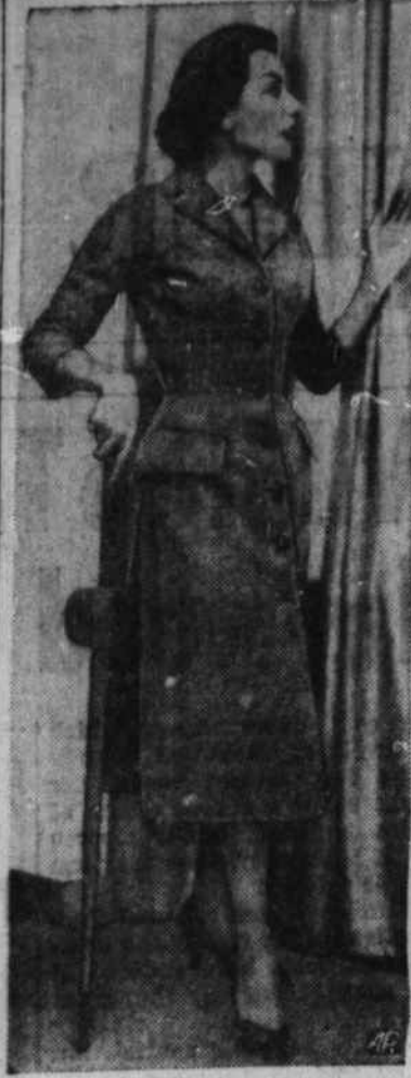
COAT DRESS . . . Gray tweed knit dress with a coat look, button front and wingback jacket effect in back.