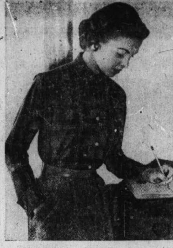
SHIRTSLEEVE FASHIONS . . . Here are two advance fall fashions in feminine shirts, designed by Digby Morton of London for sale in America. At left is a traditional Scotch tartan in a timely tailored shirt with widespread, short-pointed