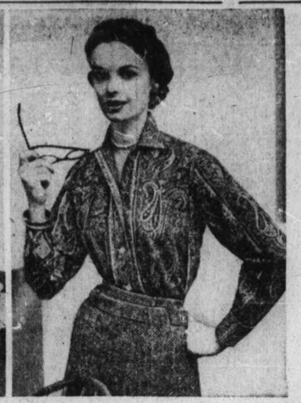
convertible collar, French cuffs and perfectly matched pocket. At right, a striking Paisley print on fine wool challis, used in a smart tailored shirt for town or country. Morton recommends tweed skirts to team with both shirts.