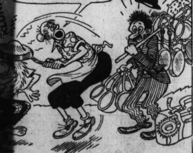
ROAD FOLKS. PAM. ACCEPT NO SUBSTITUTE

By STANLEY WHY YOU HEAR THAT? THESE NEW SKILLETTS HAVEN'T THE RICH RINGING SOUND O' QUALITY LIKE THE OLD ONES YOU ALWAYS SOLD—