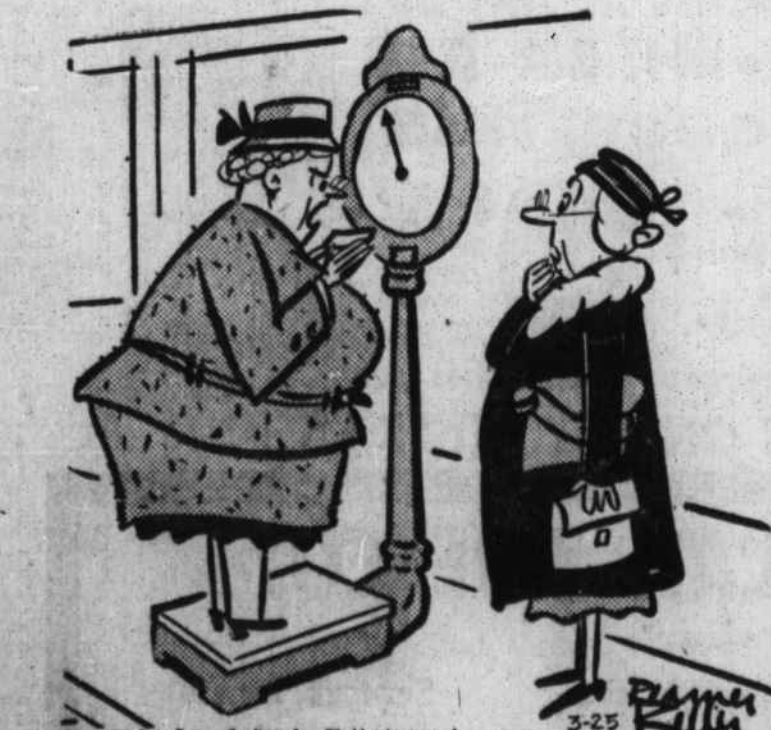
Copyright 1955, King Features Syndicate, Inc. World rights reserved. 3-25