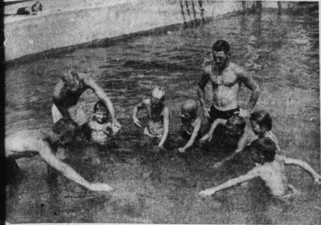
SWIMMING INSTRUCTIONS have been in- structed at Lake Junaluska pool this year— including 169 pupils in three divisions. Instruc- tors are these youngsters at the lake Tuesday were