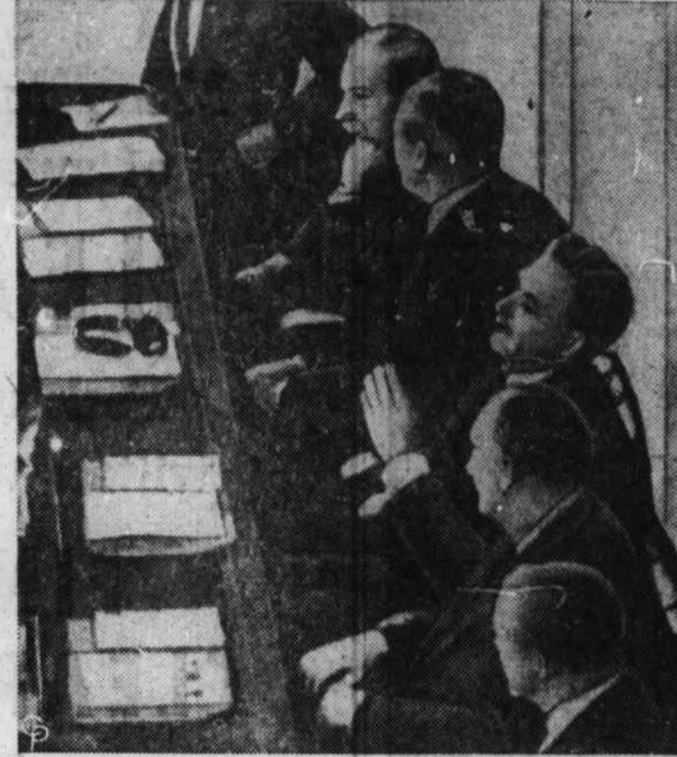
PRIME MINISTER Sir Anthony Eden (third from top) leans backwards as he attends a session of the Big Four conference in the old League of Nations Council Chamber in Geneva.

are slow to panic, difficult to fool and enslave. So it is good to know that this year Americans are thoughtfully turning pages of 350,000,000 books drawn from public libraries alone.