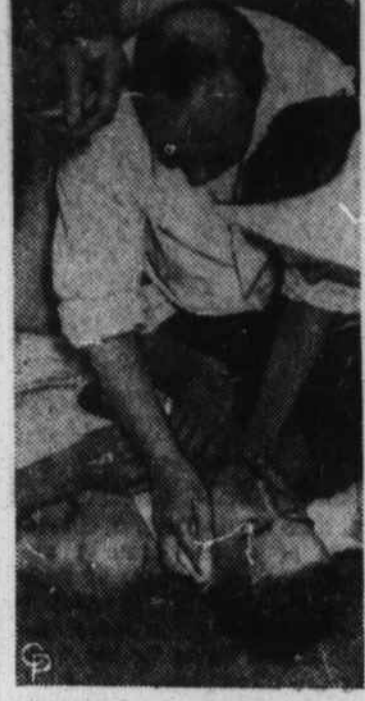
BRITAIN'S noted runner, Gordon Pirie, is treated after collapsing during the A. A. A. Championships at White City Stadium, London.