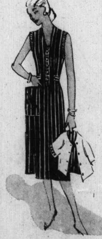
By VERA WINSTON

THE refreshing color scheme that is brown and white is turning up with happy frequency this summer and, seems destined to carry on in the season ahead. But right now here it is, the star of a golf or spectator sports dress of striped cotton. White ribbing marks the open armholes and the buttoned front band. The belt starts from the sides in front and buttons in back. One large pocket at right hip and kick pleat in back.