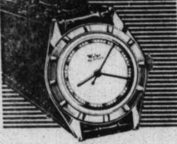
14K gold top, steel case, index figures, sweep second