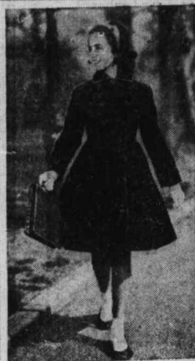
WHEN SCHOOL DAYS are cool days, this grammar girl picks a coachman's coat in wool and camel's hair fabric with matching hat,

3. Avoid buying a size or two stood silent and unhappy. Select