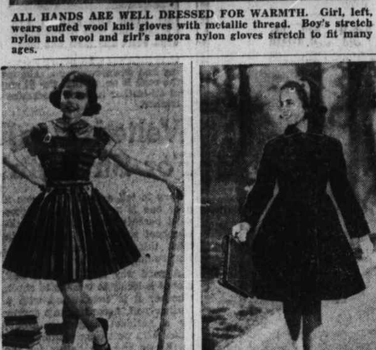
FULL MEASURE of classroom fashion is provided by long torso dress in washable Sanforized woven cotton. Yoke and tabs ac-cent pastel stripes.

Being properly dressed for the Don't try to make your child the time and place is good manners for the young and old alike.