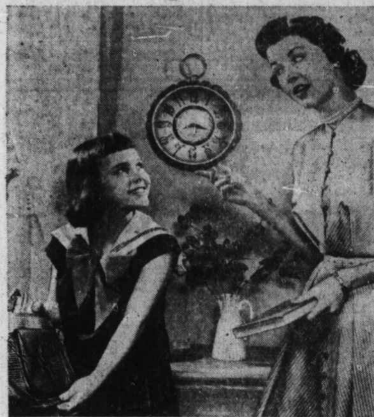
TIME TO GO BACK TO SCHOOL is a lesson in punctuality for the younger ones, which can be made vivid for them by mother with the help of a handsome and decorative big-faced clock.