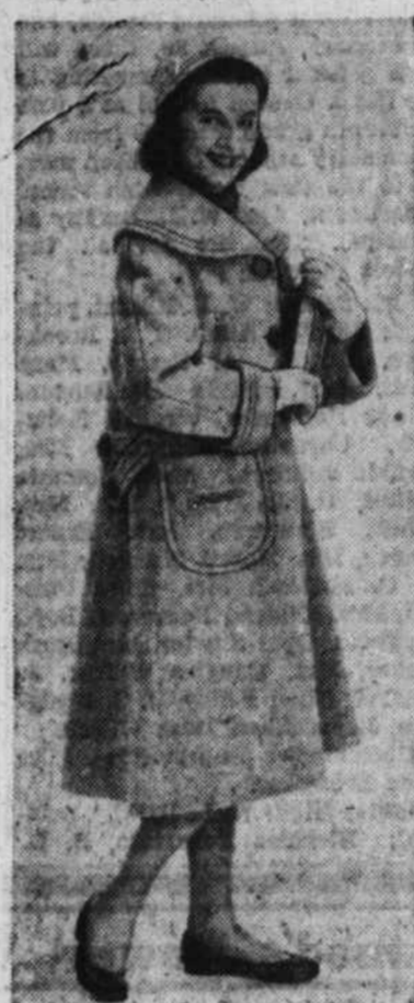
POCKETS A-PLENTY for the school set in this warm Ancuna coat with twin tab trim and modified pyramid styling.