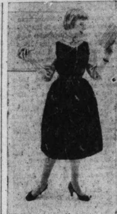
JUNIOR HIGH JUMPER—pencil-sketch cotton print with scoop neck and dirndl skirt. Separate shirt has tab sleeves, round collar.