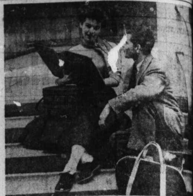
COMPARING NOTES. TEENAGERS are finding inexpensive necessary luggage just the thing to help them toward better living. She chooses a smart looking hatbox for taking everything to her locker, back to school and he favors a leather trimmed club bag for his sports gear. The vogue is sweeping the campus.

The college bound girl armed with this basic information will find it easier to stretch her going-away budget, and with the help of well informed clerks in hometown stores, can shop with confidence at home for fashions and accessories that will fit properly into her coming life away from home.