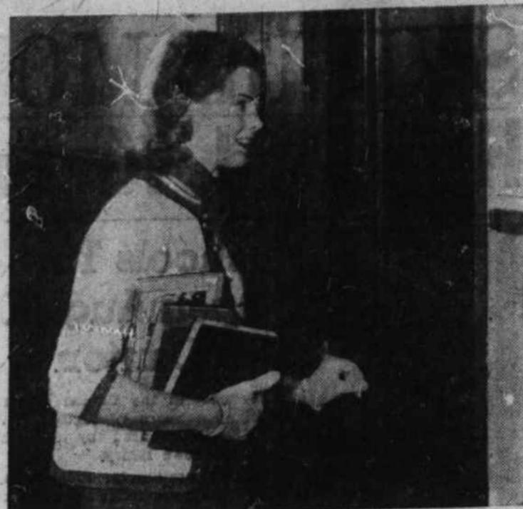
OPENING THE DOOR TO A NEW ERA of teen age trimness, the high school girl will choose easy to care for fashions and smart accessories for a well groomed appearance. Even gloves, which she will wear more often to class, can be completely washable as are pigskin shorties.

The first white man to cross Texas was Cabeza de Vaca.