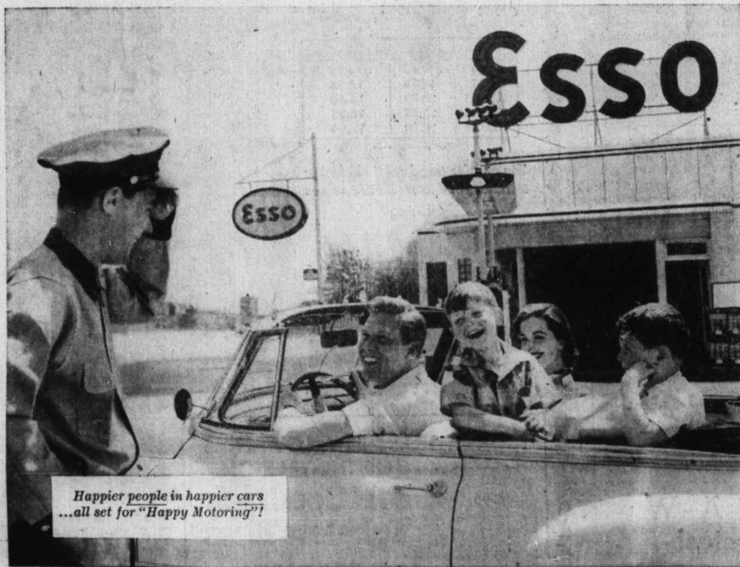
Happier people in happier cars...all set for "Happy Motoring"!

WHY DO MORE PEOPLE IN THE CAROLINAS BUY ESSO GASOLINE THAN ANY OTHER?