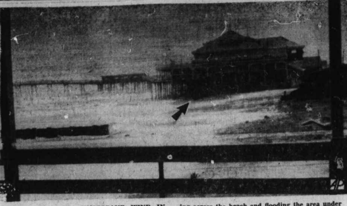
DEBRIS FLIES ON HURRICANE WIND IN CAROLINA—A piece of roofing (arrow) flies through the air on a howling wind and high tides roll under historic Lumina dance pavilion at Wrightsville Beach, as Hurricane Connie batters the Carolina coast. The turbulent water is sweeping across the beach and flooding the area under the pavilion which stands some distance back from the normal low water line. The wreckage at the right was left by Hurricane Hazel which did seven million dollars damage at Wrightsville Beach last October.