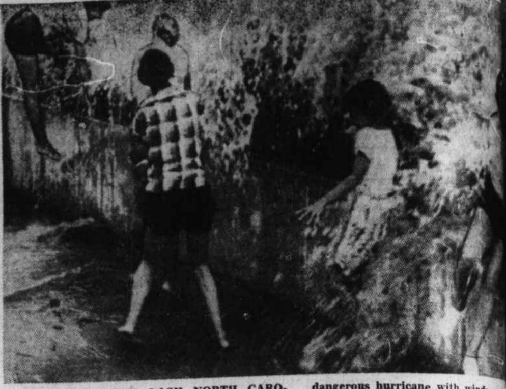
HURRICANE WAVES LASH NORTH CAROLINA COAST—High waves whipped up by Hurricane Connie pound against the sea wall at Atlantic Beach near Morehead City, but they don't seem to frighten these girls on vacation. The dangerous hurricane with winds up to 100 mph was slowly moving closer to the Carolina coast at the time this photo was made.