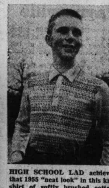
HIGH SCHOOL LAD achieves that 1935 "neat look" in this knit shirt of softly brushed cotton, with placket collar and multi-colored pattern, set off by leather charcoal twill trousers, reversible to match either or trousers.