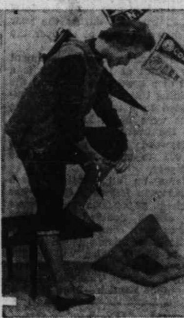
LOUNGING GLAMOUR for comfort conscious co-ed in corduroy ensemble and seamless stocking in knee high version.