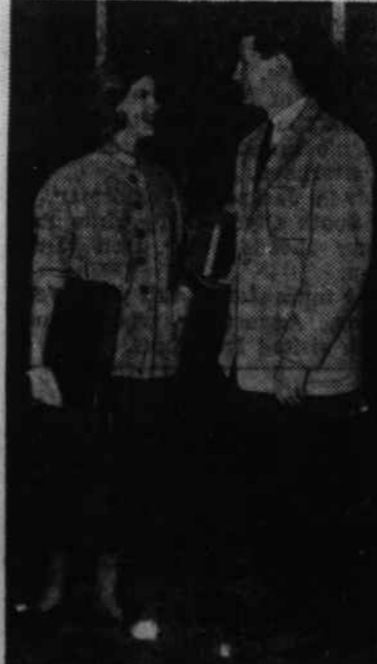
COLLEGE CORRIDOR CONFERENCE IS a style study in leather. Boy wears leather jacket in coffee-tan Quillon suede; girl sports jacket in soft banana yellow launder-leather.