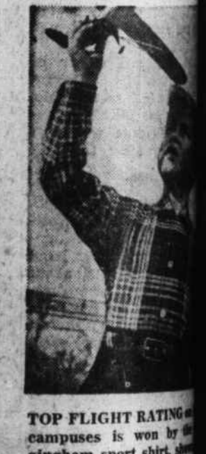
TOP FLIGHT RATING on campuses is won by the gingham sport shirt, shown in red pattern, coordinating charcoal twill trousers, reversible to match either or trousers.