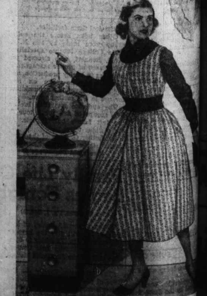
BACK-TO-SCHOOL FAVORITE . . . Light jumper, in new look for school belles. This is black and white plaid with high shirt, easy to make.