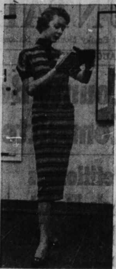
ABOVE ALL, the overblouse at college. The fitted jersey tweed here, takes a slim matching skirt for many smart assignments.