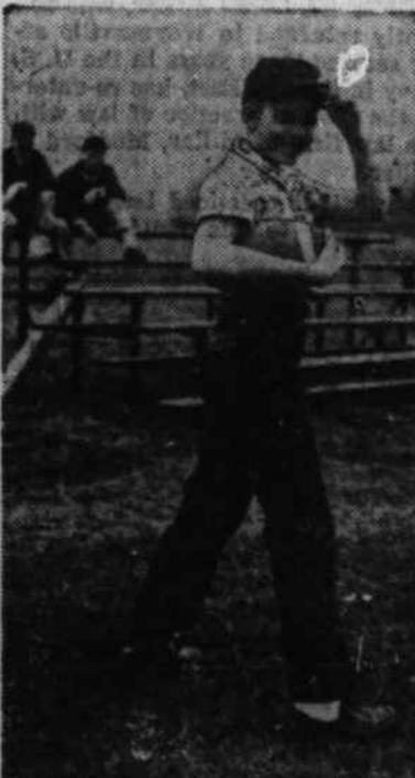
AFTER CLASS when it's time for rough-and-tumble play, boys do a quick change into sturdy denims in authentic western cut, exemplified here by lad in wranglers.