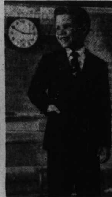
NEAT IS THE WORD for this two-tone plaid corduroy sport coat with velvet collar. Coat comes in color combinations of red and black, apricot and brown, turquoise and black, aqua and black.