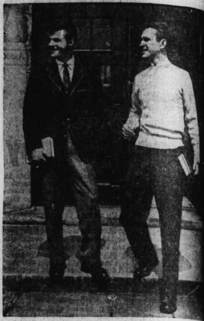
BACK TO COLLAGE, THEY GO, maintaining that smart appearance (with the casual air) that is a "must" on the campus this year. The man at right wears a college favorite, the pullover sweater with high neck closing. His friend wears the piped wool blazer in navy, braided with a red trim, the newest coat style this year.

Next fall will see more lavish fabrics, more elegance, more dressing up and less dressing