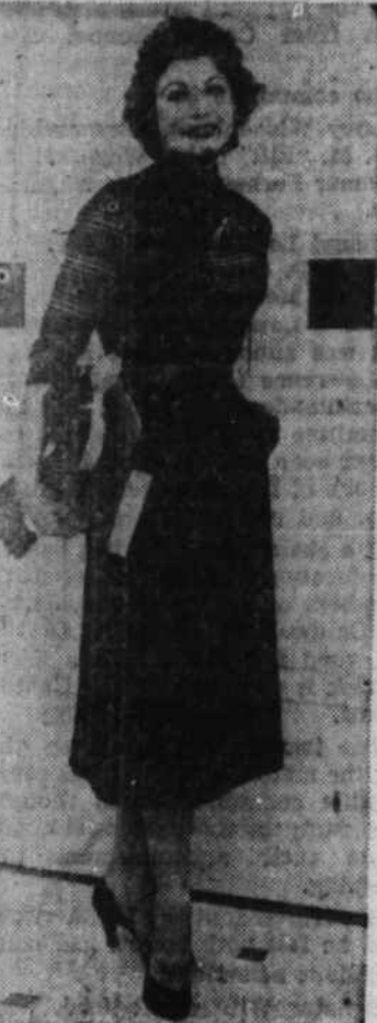
ACADEMIC HONORS for a jumper with blouse by day and solo at night. Wool flannel sheath and jersey blouse.