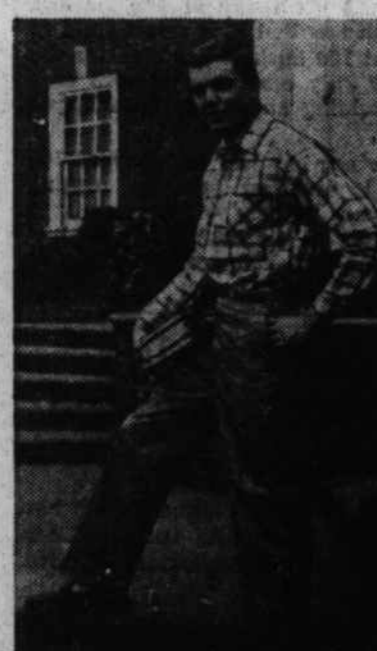
NEAT FOR CLASS and campus, are Chino trousers with plaid cotton flannel shirt, as shown here. They make a combination, keyed to the new trend.