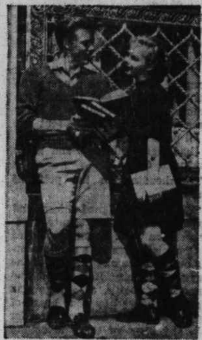
CAMPUS CASUALS—Bermuda shorts and girls' knee-length skirts take knee-high socks to set a major college trend. Here, khaki shorts and a flannel kiltie skirt team up with colorful argyle socks for handsome harmony.