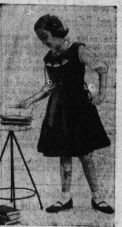
JUMPERS ARE BOOKED for classroom duty in every grade. This flared skirt style has new circular collar. In washable Sanforilan wool flannel.