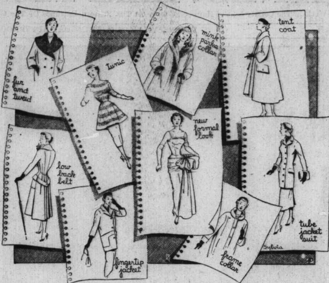
FALL FORECAST — Here are highlights of new fall fashions which will arrive in stores in September.