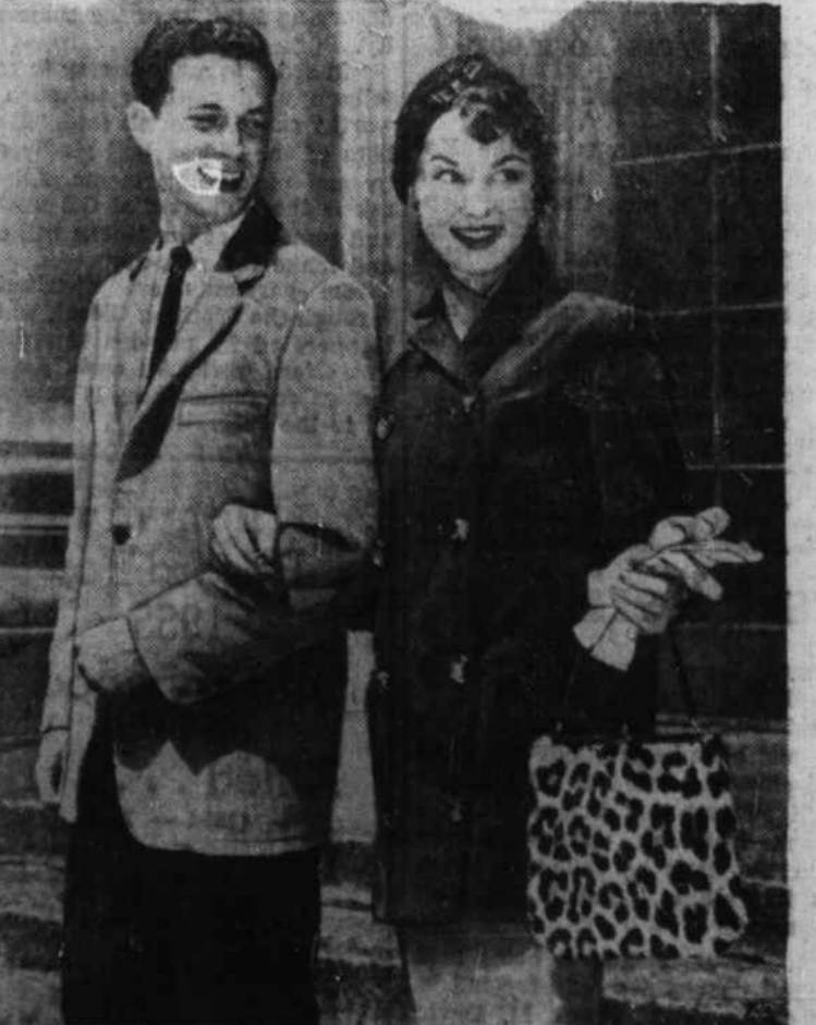
CAMPUS CHOICE . . . Both guys and dolls in the young crowd wear wide-wale corduroy jackets this fall. Here the boy friend wears beige sports coat with leather buttons and collar. His date is smart in an avocado green jacket and camel skirt.