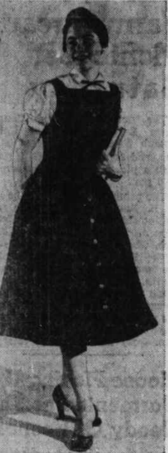
HIGH-LIGHT jumper features new drop torso, high square neckline. Class-correct blouse is dismissed at date-time. Flannel jumper.