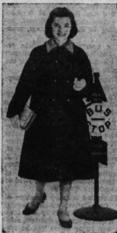
A-LINE RATES AN A in an Ancona coat with flare back, velvet frame collar and flap pockets. A go-everywhere favorite for teen-agers.