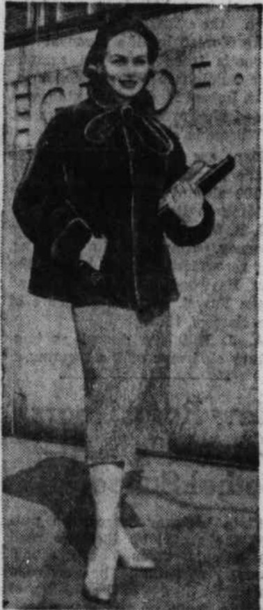
DOUBLE-DUTY FUR coat hearty enough for campus, lovely enough for formals. Associated Fur Manufacturers suggests sheared raccoon in natural brown-grey.