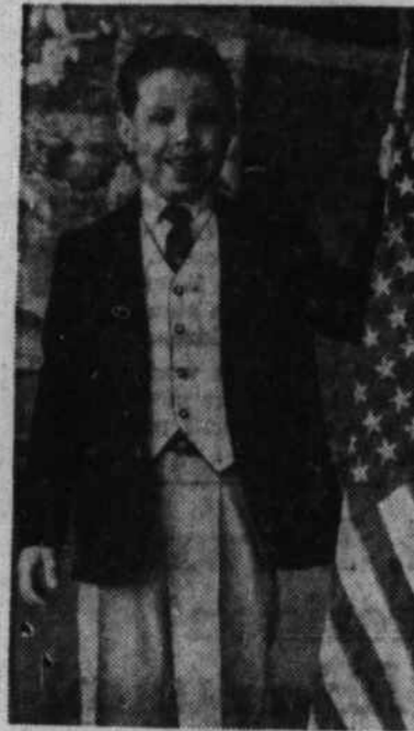
TRIM THREESOME of sport coat, vest and slacks, in attractive color combinations, introduces the "neat look" to the younger set. Coat is basket-weave wool; vest is Orion; slacks, rayon flannel.