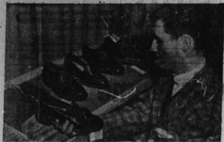
THE DISCRIMINATING COLLEGE MAN who goes for better grooming this year, develops a campus footwear wardrobe of all leather shoes, with low cut sides and continental style prevailing, choosing from models as pictured above: in hand, high tongued Italian styled moccasin, left to right on desk; plain toed cordovan blucher; slim toed moccasin, in black; rugged Scotch grain wing-tip; two eyelet tie in lariot tan crushed grain.