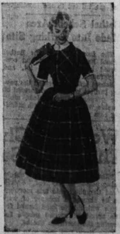
TIMELY FOR SCHOOL cotton plaid separates with pique trim, patent belt and the look of a dress.