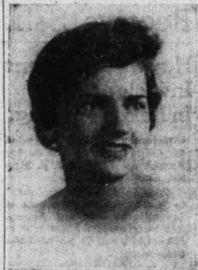
KURT GANS - "The Store Brides Prefer"