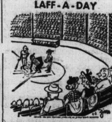
"He isn't so neat around the house."

This Friday, Canton hosted the Brevard Blue