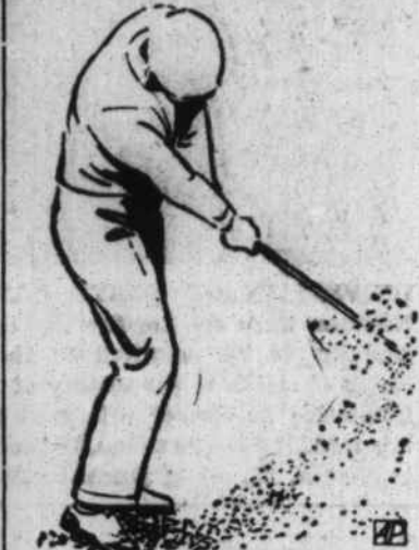
WET SAND TRAP SHOT