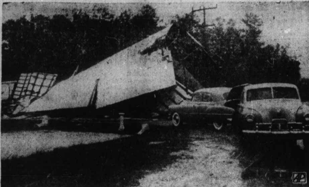
HURRICANE IONE leaves trail of wreckage. Salvage workers pull an automobile from the wreckage of a drive-in theater near New Bern, after hurricane Ione slammed into the coastal area, doing damage that runs into millions of dollars.