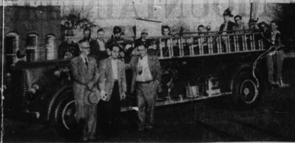
CLYDE'S FIRE DEPARTMENT has a new truck and building, plus much modern equipment. Here are some of the members of the department, with their truck in front of the fire station.

Are rooms in which oil heaters are used, properly ventilated for