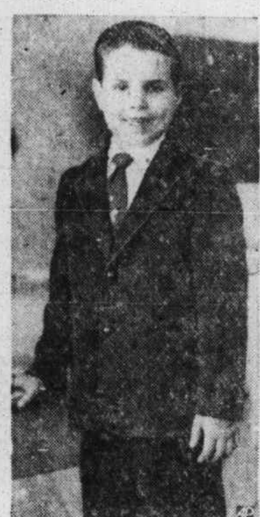
NEW LOOK FOR BOYS . Red pinwale blazer with black velvet collar, Designed by William Schwartz

The Chesterfield top coat, with fly-front and velvet collar, also is new and smart for the marbles-and-