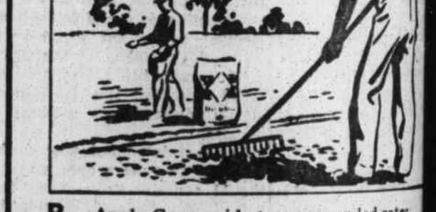
B. Apply Cyanamid at recommended rates.