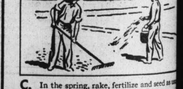
C. In the spring, rake, fertilize and seed as usual.

ADVANTAGES OF AERO® CYANAMID FOR TOBACCO BED WEED CONTROL 1. Eliminates costly, back-breaking, hand weeding. 2. Supplies long-lasting nitrogen. 3. Produces stronger, healthier plants that grow faster in the field. THE BAG WITH A BONUS kills weeds and feeds plants ASK FOR FREE LEAFLET REMEMBER —CYANAMID plus a soil fumigant lowest-cost way to control weeds and nematodes in beds. See your dealer and place your order today. AMERICAN Cyanamid COMPANY AGRICULTURAL CHEMICALS DIVISION 16 West Martin St., Raleigh, N. C.