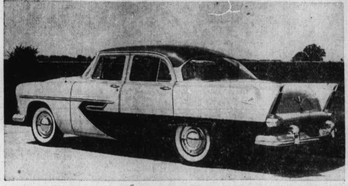
Belvedere four-door sedan is one of 15 attractive models in Plymouth's 1956 line of cars. Aerodynamic styling, push button driving and powerful new Hy-Fire 277 engine are among outstanding features. Safety door latches and other safe driving items are standard equipment.