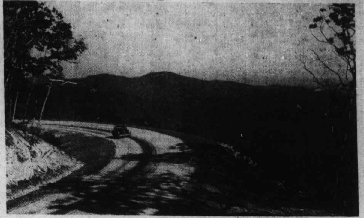
One of the many scenic views from Pisgah Parkway.