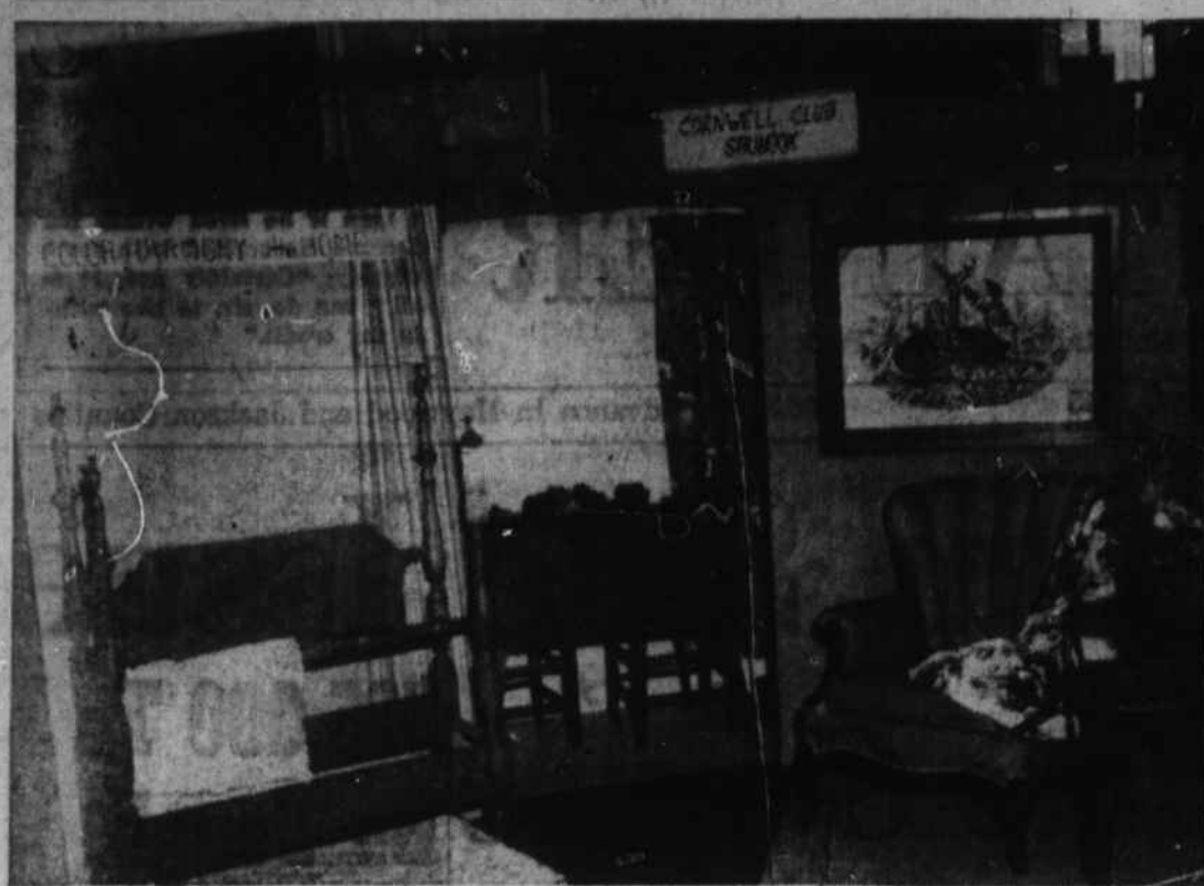
THE CORNWELL CLUB OF SAUNOOK showed the pleasing effect of "color harmony in the home," with an exhibit of furnishings at the Waynesville Armory.