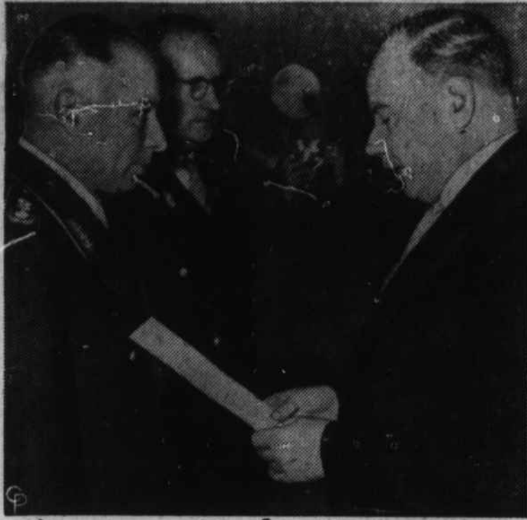
DEFENSE MINISTER Theodor Blank (right) presents commissions to the first generals in the new German army at ceremonies in Bonn. They are Adolf Heusinger (left) and Hans Speidel, both major generals in Adolf Hitler's Wehrmacht. They were given a lieutenant general's rank. A total of 101 volunteers were sworn in as part of the army's anticipated total of a half million.