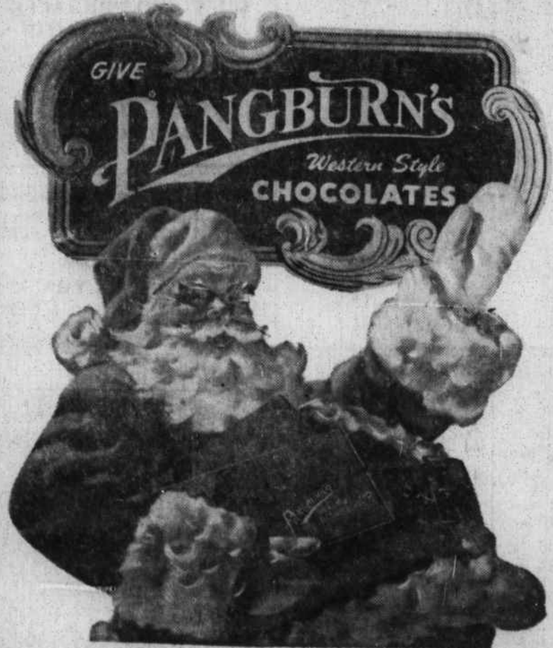
Candy is a part of the Christmas Season. Be sure it's the finest . . . give Pangburn's.

Suits a man to a T, because it contains two basic shaving essentials...man-size mug filled with about nine months of smoother, faster shaves from moisture-retaining Shave Soap ... matching ship-decorated bottle of bracing After Shave Lotion. Briskly scented with tangy Old Spice. Man-tailored gift box.