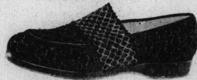
— LADIES' — Black and Red