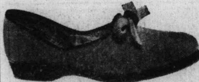
— LADIES' — Gray