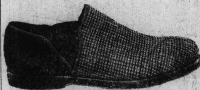
— MEN'S AND BOYS' — Tan, Blue and Wine