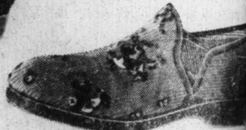
— CHILDS — Tan and Blue