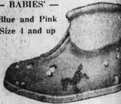
— BABIES' — Blue and Pink Size 4 and up