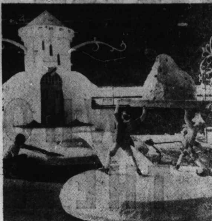
PRESENT-DAY FLOATS are products of skilled artists, designers and craftsmen. The metal frame is covered with chicken wire, sprayed with plastic "cocooning," then covered with flowers.