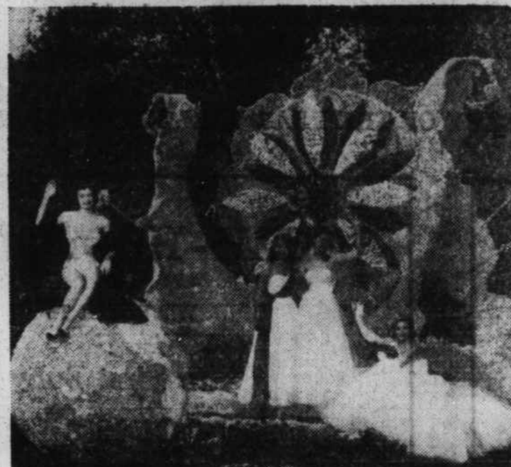
ADDED DELIGHT to viewers of the Rose Parade are the bevy of beauties, shapely majorettes, smart bands and equestrian units. Parade starts at 9:15 a.m., Pacific Standard Time, and lasts two hours.