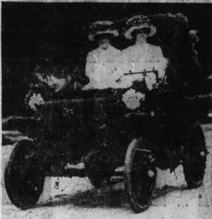
THIS TYPICAL ENTRY in an early Pasadena, Calif. Rose Parade is a far cry from lavish floats of today.