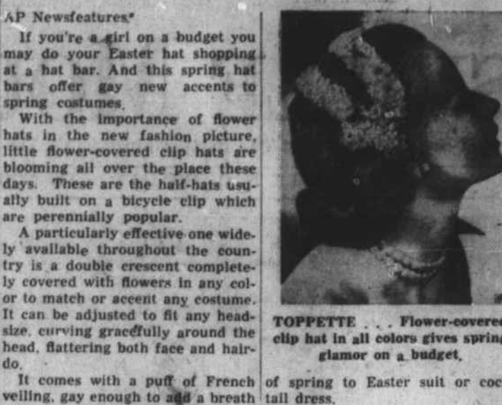
TOFFETTE... Flower-covered clip hat in all colors gives spring glamor on a budget.

It comes with a puff of French twirling, gay enough to add a breath