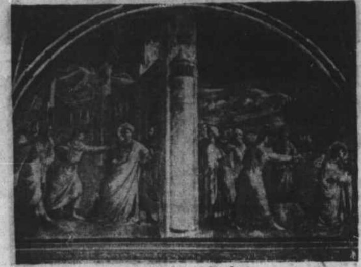
The stoning of Stephen.

"To you it is given in the behalf of Christ, not only to believe on Him, but also to suffer for His sake."—Philippians 1:29.