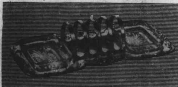
Georgian Toast and Marmalade Dish FORMERLY 6.95