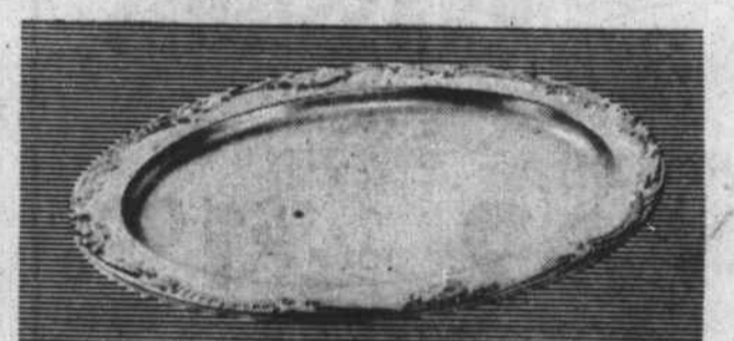
Georgian Plain Meat Dish FORMERLY 15.00