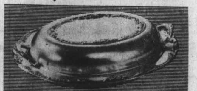
Georgian Covered Vegetable Dish FORMERLY 15.00