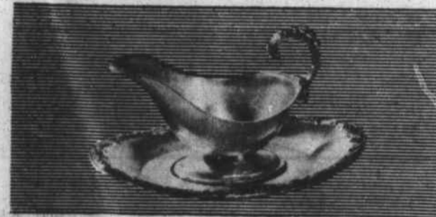
Georgian Gravy Boat and Tray FORMERLY 15.00

believably LOW prices! Here is handsome, expensive-looking silverplated hollowware you'll want for your own home—ideal for that special gift—priced to fit your pocketbook!