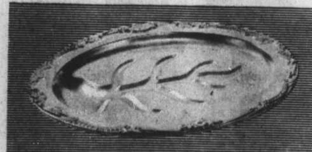
Georgian Well and Tree Meat Dish FORMERLY 15.00