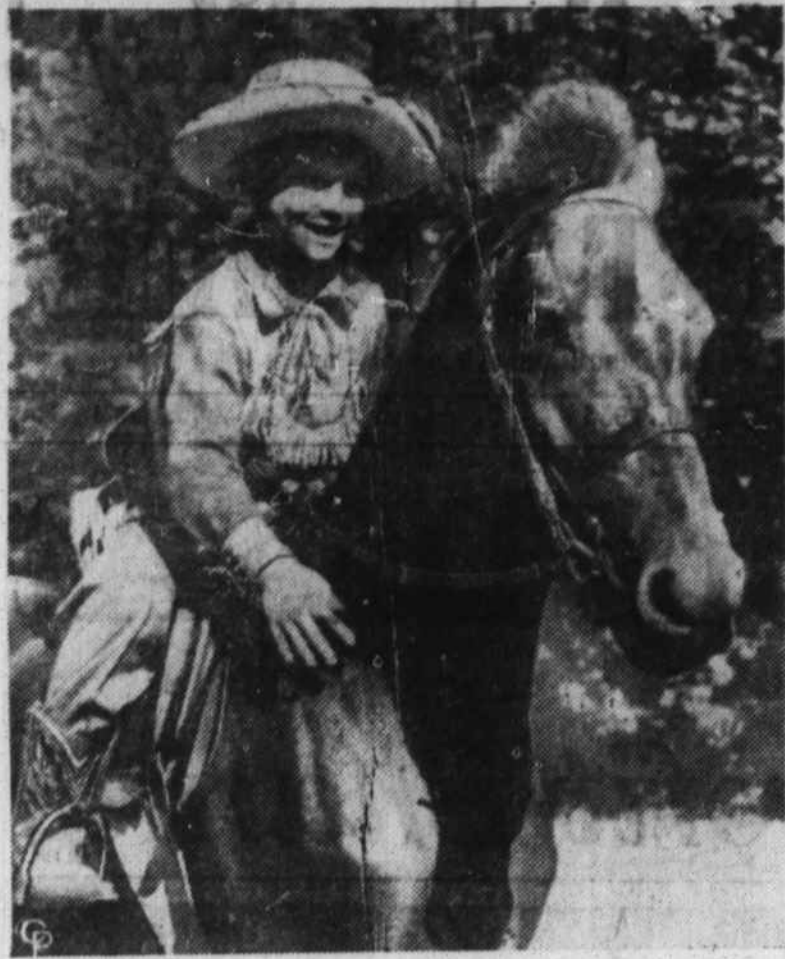
CROWN PRINCE Carl Gustaf of Sweden, who likes his American western tales as does any boy his age, wears a cowboy outfit as he rides his horse, "Don Basilio." With members of the Swedish royal family, he is spending a vacation on Oland Island in the Baltic Sea.