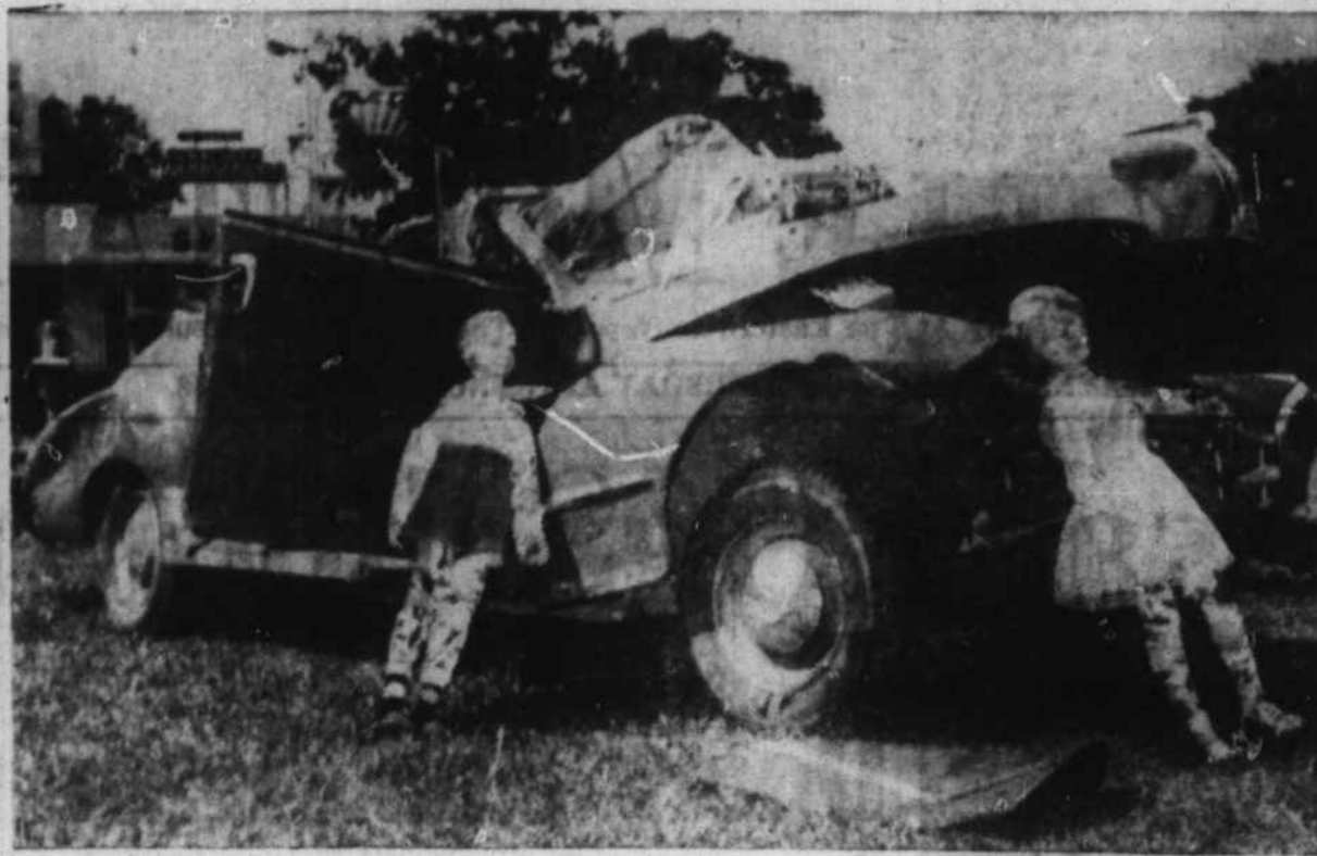
A GRIM REMINDER to Labor Day holiday motorists to drive carefully is this display near Lake Junaluska at the intersection of Highways 19 and 19A-23. This wrecked car is the same one that injured seven people recently when it plunged off the mountain road at Cove Creek Gap. The exhibit, set up by the State Highway Patrol, also includes "graves" of careless drivers, and a funeral home's sign saying "Speeders Are My Best Customers".

FREPORT, Minn. (AP)—Thieves with either an unlimited appetite of fancy picnic plans broke into a supermarket here and took 130 pounds of minced ham, a case of chopped ham and 40 pounds of sausage. Possibly thinking of dessert they grabbed $60 from the cash register.