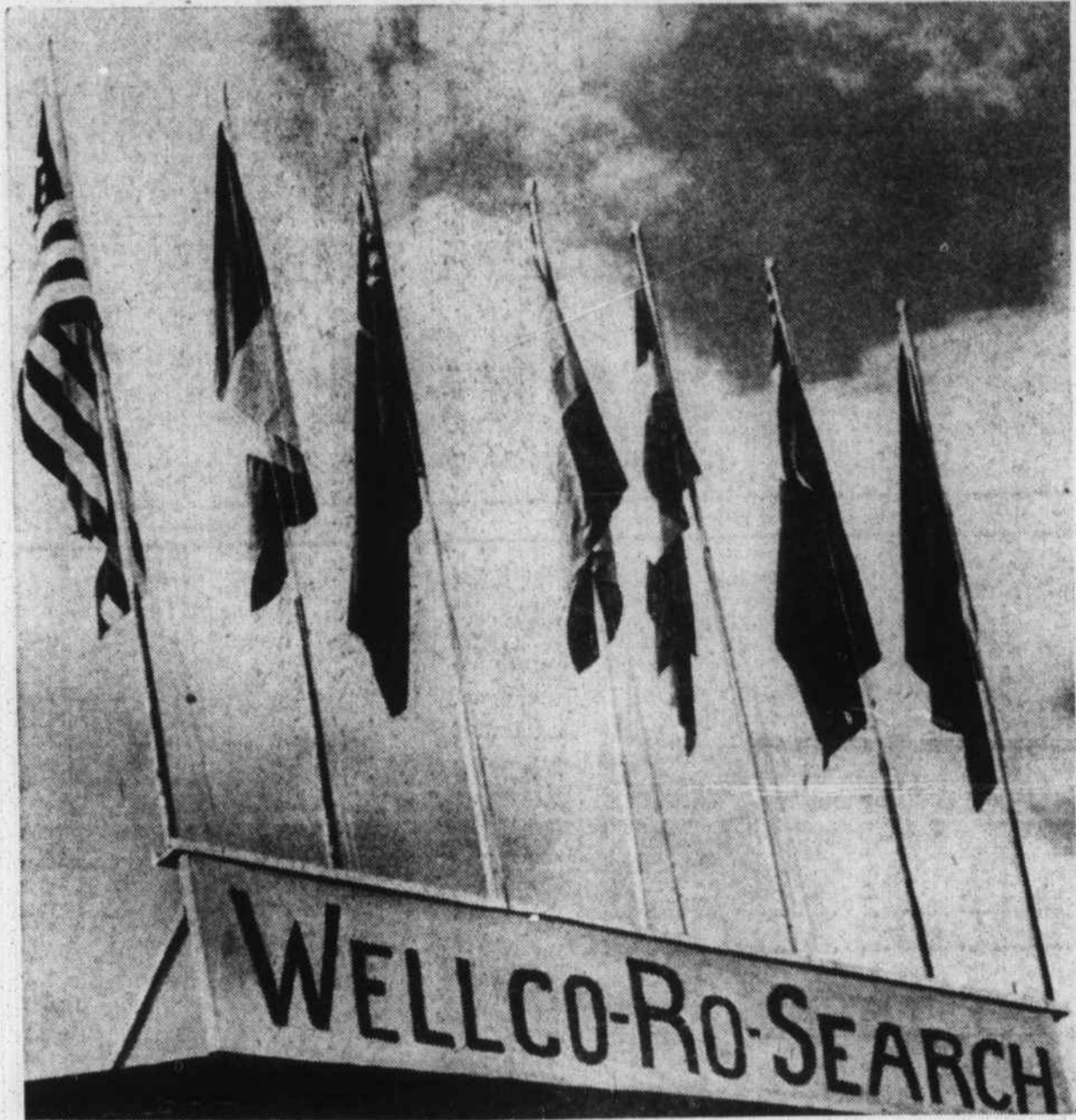
FLAGS OF MANY NATIONS represent the 60 countries throughout the world which are affiliated with Hazelwood's Wellco Shoe Corporation and Wellco Ro-Search.

OUR TOWN DOES NOT HAVE THAT "OLD-FASHIONED" LOOK!