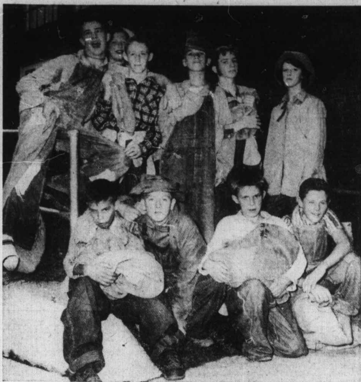
THIS ROUGH-LOOKING BAND of mountaineers and mountaineers is in reality a group of students at Crabtree-Iron Duff High School who underwent a joint initiation conducted Friday by the Future Farmers of America and Future Homemakers of America at the school.