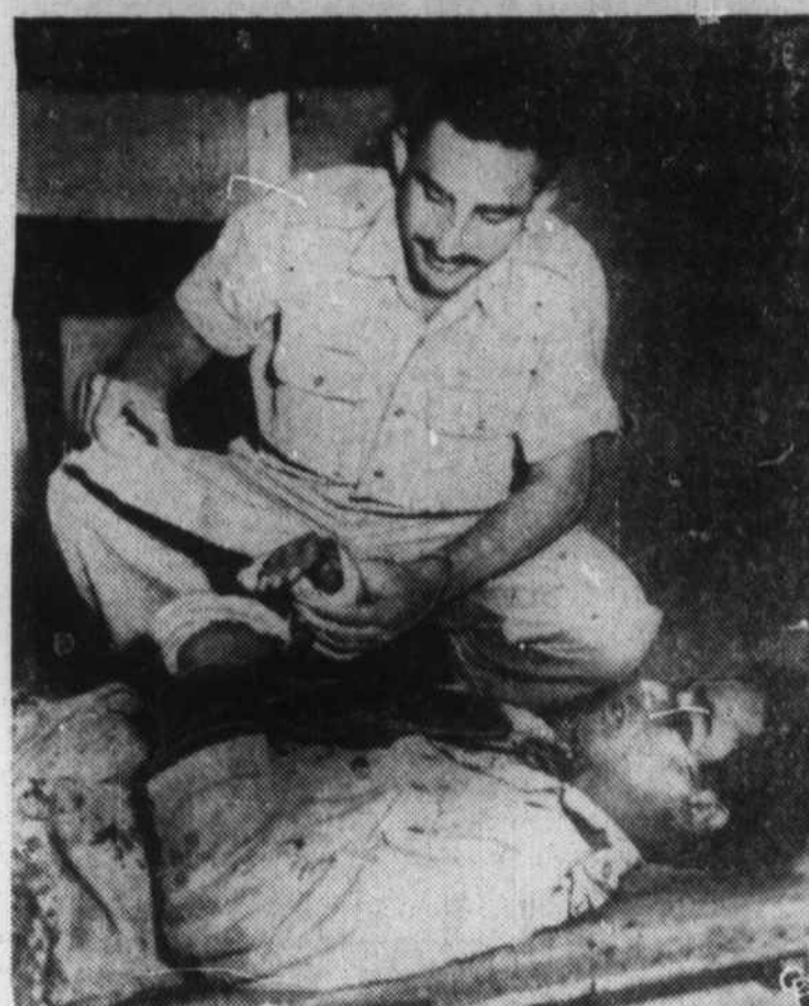
INTERCEPTED BY AN ISRAELI patrol near the desert home of Israel's Premier David Ben-Gurion, an Egyptian "suicide" commando is treated for wounds at a hospital in Jerusalem. Two of four infiltrators were killed and the others wounded in a grim clash near Sdeh Boker in northern Negev. At the time, Premier Ben-Gurion was in Tel Aviv attending a cabinet meeting.