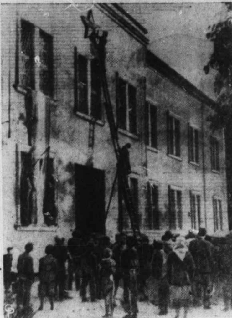
YOUNG HUNGARIAN BOYS and adults stand in front of the Security Administration building in Keckemet as two of the "Fighters for Freedom" climb a ladder to take off a Red star. All through the country, patriots were tearing down Soviet statues and removing all signs of their Communist oppressors.