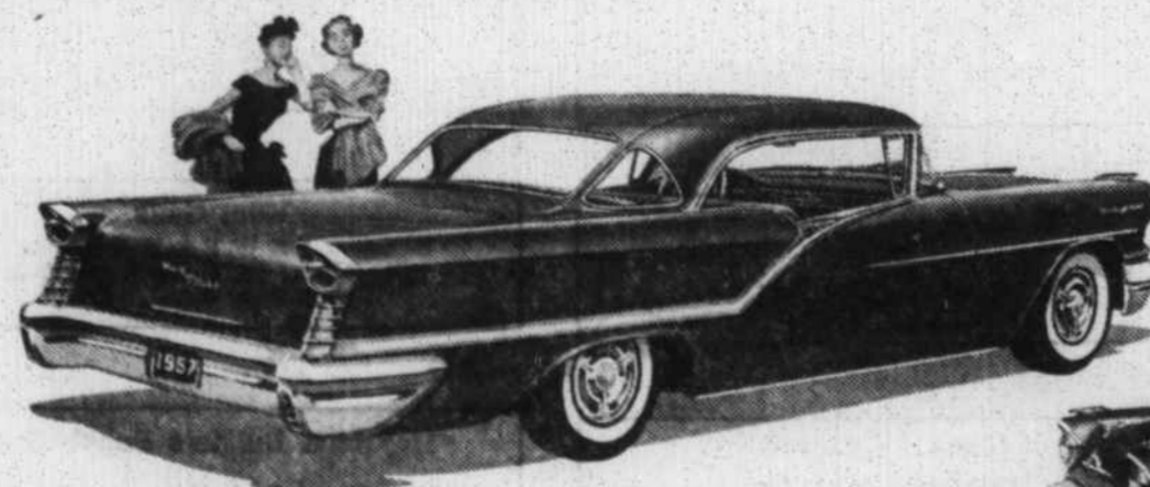
NEW STARFIRE 98 SERIES—there's nothing quite like it!

3 NEW SERIES! 17 ALL-NEW MODELS! See them now—in our showroom!