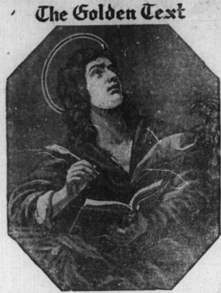
St. John the evangelist. "God Himself shall be with them, and be their God; and God shall wipe away all tears from their eyes; and there shall be no more death."—Revelation 21:3, 4.