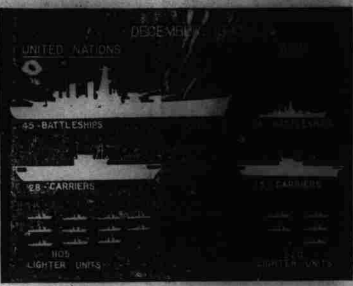
This chart from The March of Time film, "Naval Log of Victory," shows how the Allies, by cutting Axis superiority in sea battles, and by a shipbuilding program unequalled in history, came from behind to win unquestioned naval supremacy from Murmansk to Midway.