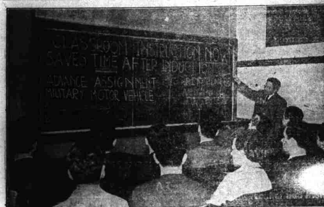
A TYPICAL high school classroom session of the Pre-Induction Driver Education Course recommended by the Army and urged by State authorities in pre-induction training of military motor vehicle operators. High schools throughout the State are now setting up these courses, which will save the Army vitally needed time and hasten victory.