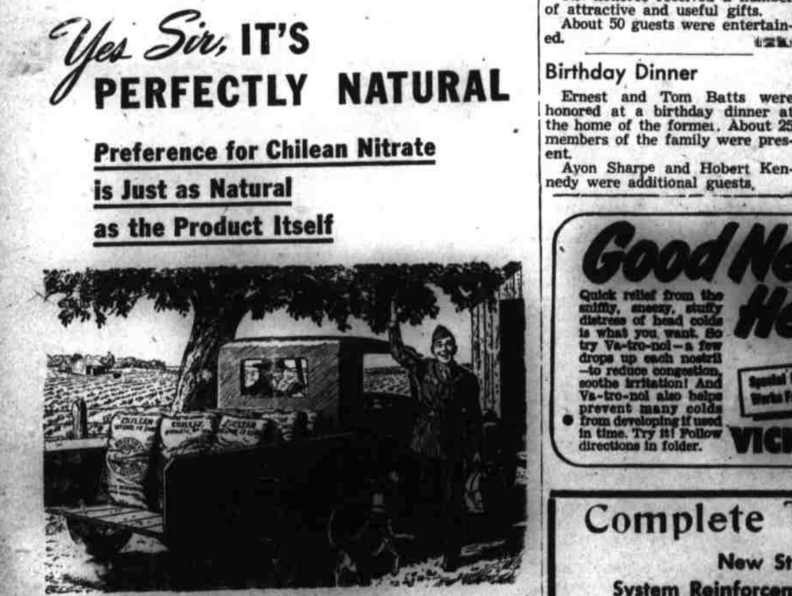
lucky .... Pop brings hon and natural altrate to side dress the crops.

Good farmers-for over a hundred years-have hauled natural nitrate for their crops. Since 1030, when the first nitrate cargo arrived from Chile, millions of tons have been used on American farms . . . 3,300,000 tons since the cutbreak of the war. This year's supply of Chilean Nitrate depends la go'y on ships avail-able to bring it in. If everyone takes his share promptly when offered, at least 850,000 tons can be supplied for this year's crops.