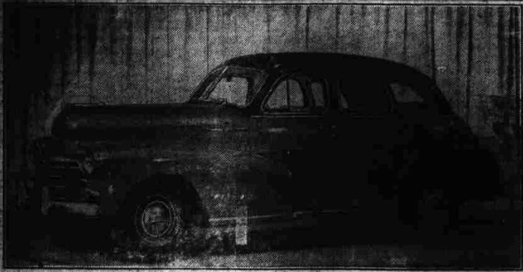
Re-styled for the new year, with emphasis on a more massive front end and a smoother sweep to body contours, the new Chevrolet will soon make its debut. New front-end grille and complementing bright work, as well as elimination of the body belt molding, have done much to give the new model an air of greater luxury.