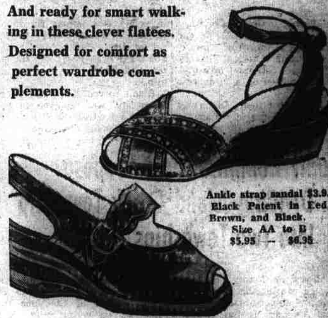
Ankle strap sandal $3.95 Black Patent in Red, Brown, and Black. Size AA to E $3.95 - $6.35

And ready for smart walking in these clever flats. Designed for comfort as perfect wardrobe complements.