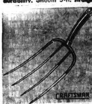
Sturdy Manure Fork

Blead, teeth, shank forged from one piece of steel for added strength durability. Smooth 5-ft. straight