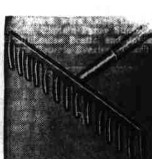
Dunlap Garden Rake 84 Strong Teeth 89c

Seasoned Wood Handles II-in. Garden Fork...... 15e