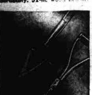
"D"-Handle Shove! Px12-inch Blode

lade edge for easier ank and blade forged one-piece steel for e tru