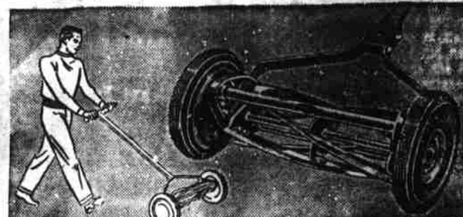
Craftsman Lawn Mower

Easy to Handle Craftsman. Famous Flex-Beam con struction for increased strength and flexibility. Forged steel tines. 4-ft. bard-word handler smooth finish.