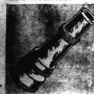
Dunlap Hose Nozzle

Best all-around shovel for spading, gging. Tempered steel blade and cket. Strong 47-inch hardwood ndle. 7x12-inch blade