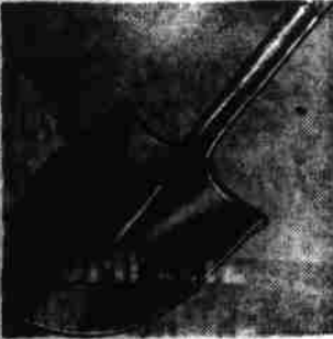
Long-Handle Shovel Dunlap Quality . . 1.69

Best all-around shovel for spading, gging. Tempered steel blade and cket. Strong 47-inch hardwood ndle. 7x12-inch blade