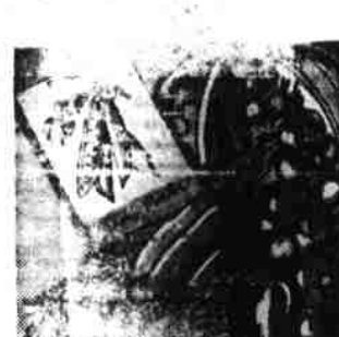
Bulk Garden Seeds lop Quality

Solid Brass djusts from fine spray to neavy or shut off Non-rust attrac-phly polished finish. Superior