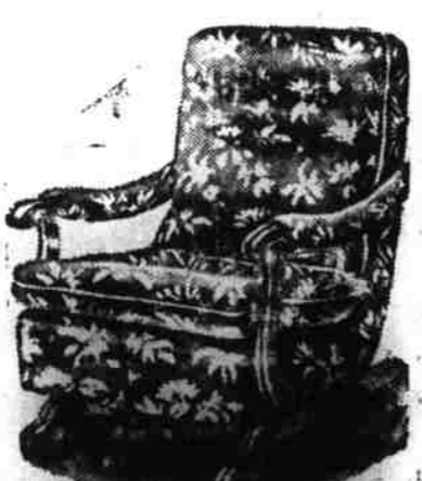
Platform Rockers Duncan Phyfe Sofas