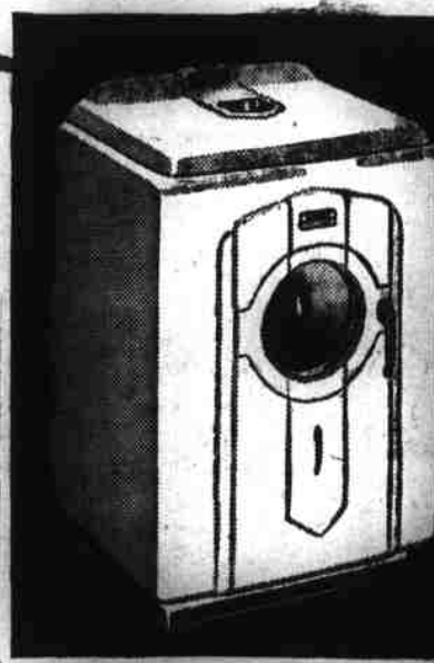
DE LUXE MODEL

NOW! $2.50 a week buys a BENDIX GET YOURS TODAY TAKE YEARS TO PAY