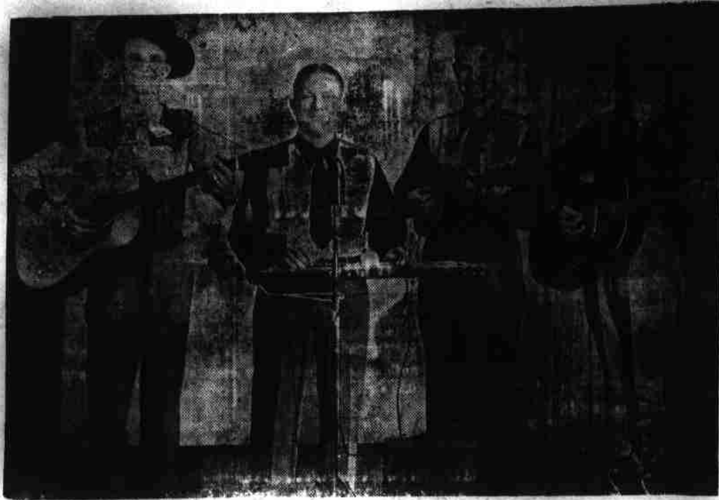
THE ROCKY MOUNTAINEERS, who will be heard daily at 12:30 p. m. over the Rocky Mount radio station WCEC. Tune in and hear them.