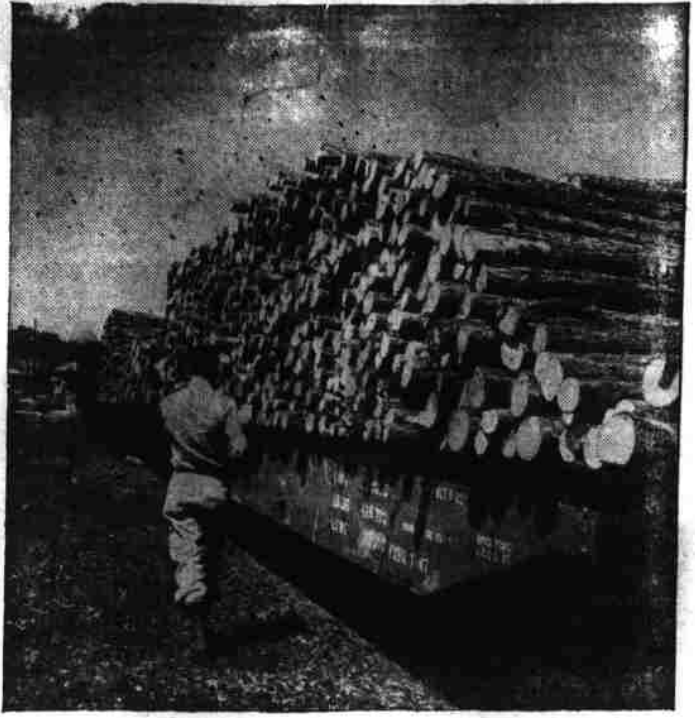
IN 1947, 83 per cent of the record total of 2,874,471 cords of pulpwood used by International Paper Company's Southern Kraft Division traveled to the mills by railroad. Company conservation engineers inspect pulpwood arriving at the mills to be sure good cutting practices have been followed.

The Socialists and Communists know that it sounds good to plead for "adequate" housing. They claim to be fighting for the people, against all sorts of bogeymen. But the people are not told that rent control, together with public housing, will go a long way toward destroying the welfare and the future of our free economy in America. We must in the future depend upon incentives and fair competition. Then there will be no housing problem in America.