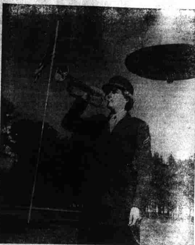
One of the highlights of the 173rd year of the Marine Corps was the authorization of the regular Women Marines. During World War II more than 22,000 women served in the active reserve.

highest bidder at public auction for cash at the Courthouse door in Kenansville, N. C. the following described tract of land: