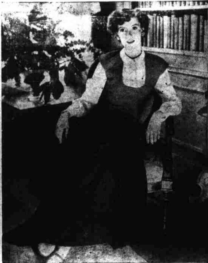
If you think your best beau would like you in one—catch up with him in this cotton-padded, quilted wool vest, worn with a tailored blouse and wool skirt. Appearing in the current issue of Good House-keeping magazine—it's new and cozy.