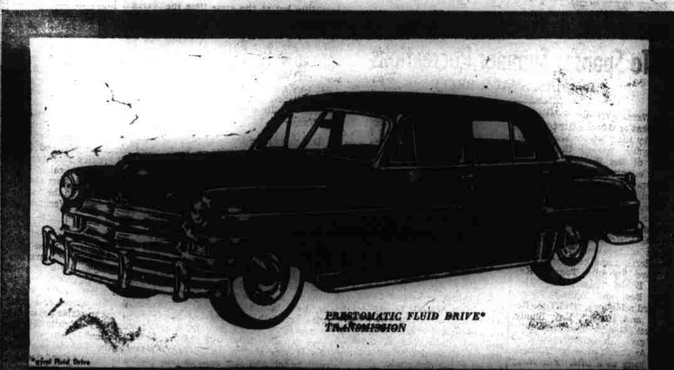
PRESTOMATIC FLUID DRIVE TRANSMISSION

NOW ON DISPLAY at Chrysler dealers everywhere. The new Silver Anniversary Chrysler. With more room—greater comfort—greater safety and performance. Completely new in its well-bred beauty! Advanced again in its inspired engineering. Like every Chrysler for 25 years, our Silver Anniversary car is beautiful because it reflects the common sense and the imagination of the engineering underneath. Your greater safety... your greater comfort... your greater satisfaction in your car's performance... these come first in the Chrysler way of building cars. And once again, with more than 50 important improvements, you are getting first from Chrysler the advances that really count. The full beauty of the Silver Anniversary Chrysler goes far beyond all that is exciting to the eye. Tailored to taste, with ample headroom—with plenty of shoulder room and legroom—with wider chair-height seats. This is a car perfect in every detail right to its jewel-like ash tray. There's more horsepower from the foremost high compression engine, the mighty Chrysler Spitfire! With Prestomatic Fluid Drive Transmission... with Safety-Level-Ride... with exclusive Safety-Rim wheels that make it almost impossible to throw a tire... with more than 50 advances in safety, comfort, convenience, and performance—this is the car you'll talk about for years to come. We cordially invite you to see and ride in it... by far the greatest value offered!