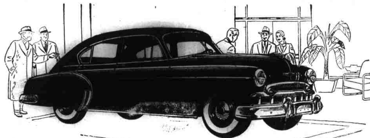
Fleetline De Luxe 4-Door Sedan White sidewall tires optional at extra cost.

for all-round quality... for all-round value